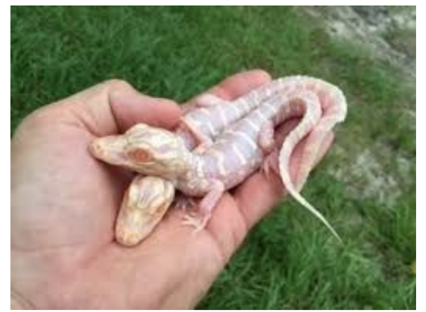
Albino Caiman Alligator

2) List three things you can compare with the two images.